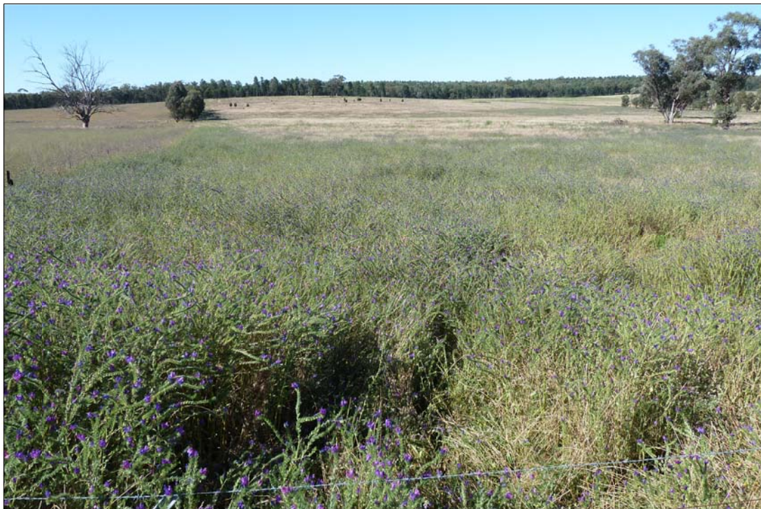
PLATE A1 Proposed site for magazine (looking south)