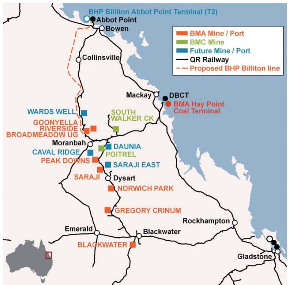
Goonyella to Abbot Point Rail Project location and preliminary investigation corridor

The final terms of reference will be displayed on the www.deedi.qld.gov.au website and provided to BHP Billiton for guidance in the development of its Environmental Impact Statement for the BHP Billiton Goonyella to Abbot Point Rail Project.