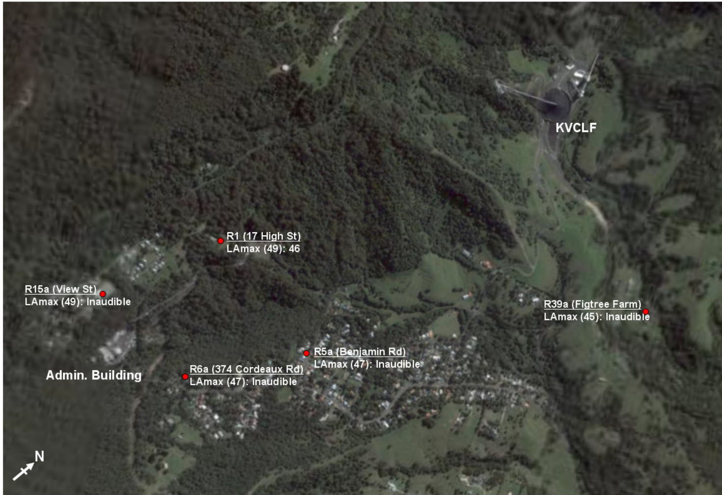
Figure 2-3 Measurement Locations & Summary of Estimated Noise Levels Contribution from Dendrobium Mine ( L_{Amax} )

Note: Site specific sleep disturbance criteria are enclosed in brackets.