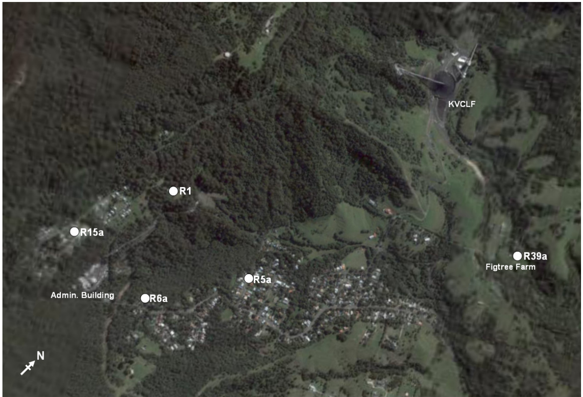
Figure 2-1 Aerial Showing Measurement Locations