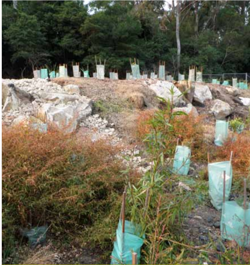
Works to install a rock-armoured gully have been conducted on Stage 1 of the Pathway to combat erosion that occurred due to heavy rains earlier in the year.

A contractor was engaged to install an additional rock-armoured gully to direct those flows safely down the bank in the future. Some additional large rocks were also installed to stabilise the embankment.