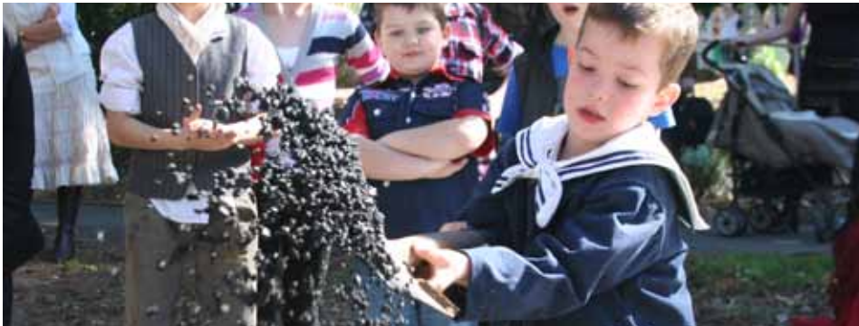
The Mt Kembla Miners Heritage Day Picnic will again be held in 2011, offering a day filled with music, food and entertainment for the whole family that showcases the proud history of the village.

Now in its fourth year, the day raised over $6,600 for the charity, which is also eligible for matching through the BHP Billiton Employee Matched Giving Program, and will see over $13,200 donated to KidzWish.