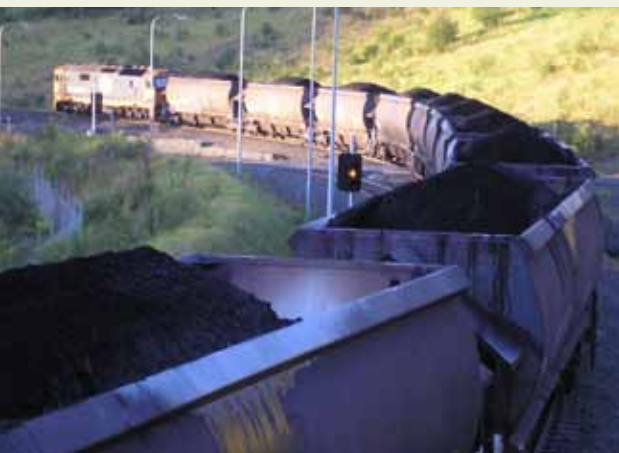
Dendrobium is urging people to be rail safety aware and never trespass inside the fenced rail corridor.